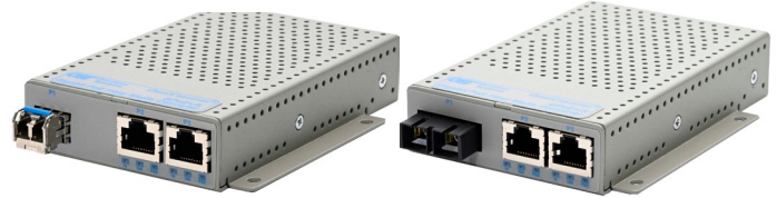
SFPs not included

*See the Model Comparison table on page 5 for the comparison of the previous/old and the enhanced models.