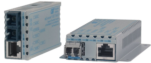
SFP not included

The miConverter GX/T PoE/D is available with or without integrated mounting brackets. miConverter GX/T PoE/D models without integrated mounting brackets can be installed in the miConverter 18-Module Powered Chassis.