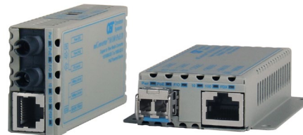
SFP not included

The miConverter 10/100 PoE/D is available with or without integrated mounting brackets. miConverter 10/100 PoE/D models without integrated mounting brackets can be installed in the miConverter 18-Module Powered Chassis.