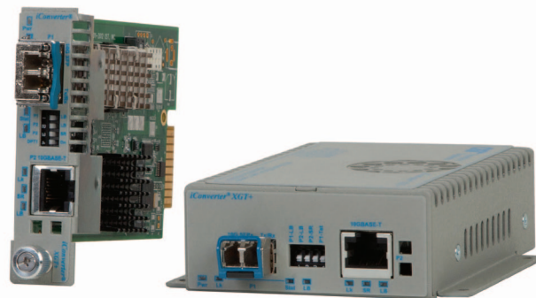
SFP+/XFPs not included

The standalone iConverter XGT+ has integrated mounting brackets and can be rack mounted (8260-0) or DIN-rail mounted (8251-1). It is DC powered and available with an external AC to DC power adapter, or 2-pin terminal connector for direct DC voltages up to 60 VDC.