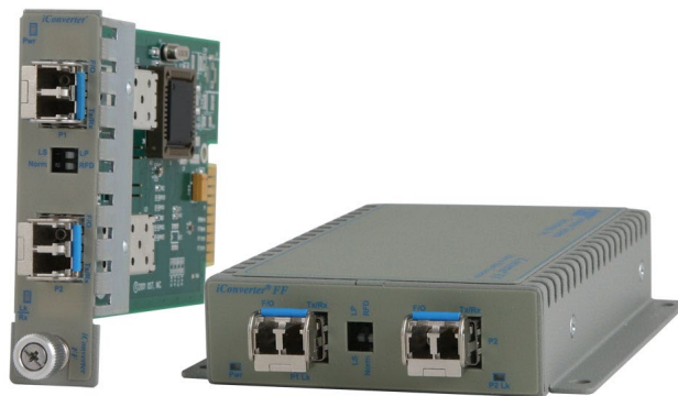
SFPs not included

The standalone iConverter xFF is an unmanaged wall-mount unit. The wall-mount models are DC powered and are available with an external AC to DC power adapter, or a terminal connector for DC power.