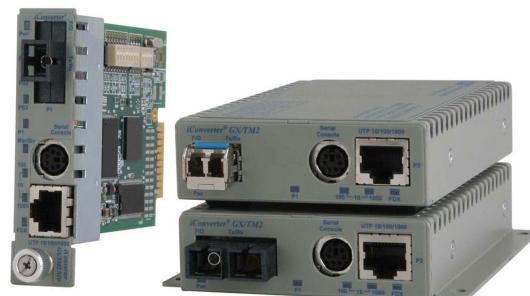
SFP not included

The GXTM2 Network Interface devices are available as compact, managed standalone units, or chassis plug-in modules. The plug-in module can manage other modules in the same chassis and operate as a managed 10/100/1000 media converter.