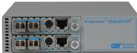
SFPs not included

Physical port interfaces include 100BASE-FX and 1000BASE-X Small Form Pluggable Transceivers for standard or CWDM wavelengths. Management interface ports and Customer-facing service ports are available in copper RJ-45 or SFP fiber interfaces.