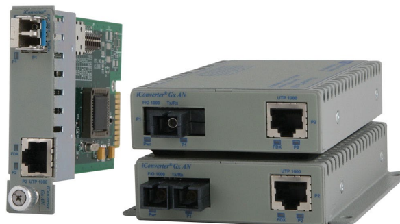
SFP not included

The iConverter Multi-Service Platform consists of Network Interface Devices, T1/E1 multiplexers, CWDM/DWDM multiplexers and managed media converters that combine to deliver Carrier Ethernet and TDM services over fiber or CWDM/DWDM wavelengths. This flexible architecture supports a wide variety of configurations for scalable and reliable fiber connectivity in Service Provider and Enterprise networks.