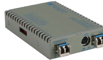
Figure 4: LED Indicators

http://www.omnitron-systems.com/forms/product_registration.php