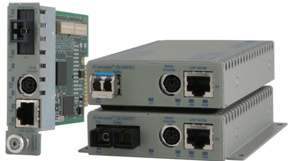
SFP not included

The 10/100M2 features multiple, user-selectable link fault detection modes, including Link Fault Propagation, Remote Fault Detection and Asymmetrical Fault Detection. These Link Modes provide rapid fault detection and isolation by monitoring the state of the copper and fiber ports, and operate independently of the network management.