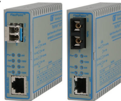
SFPs not included

GX/T modules can be standalone or surface-mounted utilizing optional wall-mounting hardware or DIN-rail mounting brackets. They can also be rack-mounted in a 5-Module shelf or in a high-density 14-Module, power-redundant chassis.