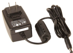
-1 = Barrel Connector and US AC/DC Power Adapter, 100-240 VAC, 50-60Hz