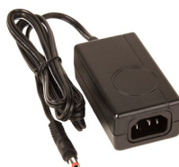
-2 = Barrel Connector and Universal AC/DC Power Adapter, 100-240VAC, 50-60Hz (requires AC power cord)