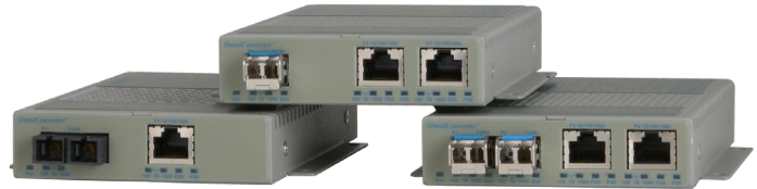
SFPs not included

The compact standalone OmniConverter media converters can be tabletop mounted, wall mounted, or DIN-rail mounted using an optional DIN-rail mounting kit. They can also be mounted on a 1U 19" rack-mount shelf. They are available with DC input power via terminal connectors or external 100 to 240V AC power adapters.