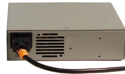
Rear of 2-Module Chassis with Power Cord

WARNING!!! NEVER ATTEMPT TO OPEN THE CHASSIS OR SERVICE THE POWER SUPPLY OR FAN MODULE. OPENING THE CHASSIS MAY CAUSE SERIOUS INJURY OR DEATH. THERE ARE NO USER REPLACEABLE OR SERVICEABLE PARTS IN THIS UNIT.