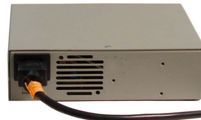
Rear of 2-Module Chassis with Power Cord

WARNING!!! NEVER ATTEMPT TO OPEN THE CHASSIS OR SERVICE THE POWER SUPPLY OR FAN MODULE. OPENING THE CHASSIS MAY CAUSE SERIOUS INJURY OR DEATH. THERE ARE NO USER REPLACEABLE OR SERVICEABLE PARTS IN THIS UNIT.